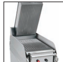
Model G828 Includes grooved upper platen and lower cooking surface.