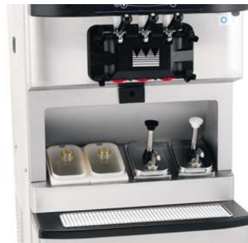
Integrated Syrup Rail Option - 2 room temperature with lids & ladles, 2 heated with syrup pumps

During long no-use periods, the standby feature maintains safe product temperatures in the mix hopper and freezing cylinder.